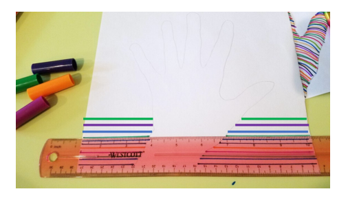
Image 4. Use a ruler to create lines OUTSIDE of the hand (optional)

5. If you feel inclined, make multiple 3D-hands with different techniques and keep track of the materials you used (e.g. markers, pencils, or crayons?), how thick the lines were, the colors of the lines, how close together the lines were, if you made lines outside the hand and more! Then judge how "3D" your different hands look. Can you figure out which attributes make your hand look the most 3D?